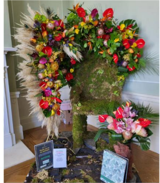
Last year's winning design

Voting will close at 3pm on Sunday 17th May when the winner will be announced at the show.